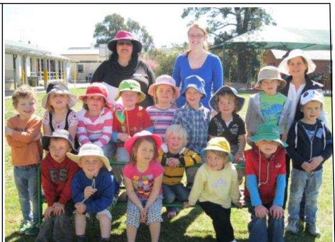
Happy Little Pre-schoolers!