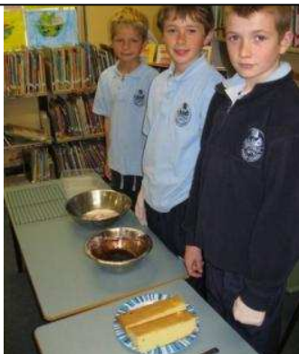
Making and packaging lamingtons