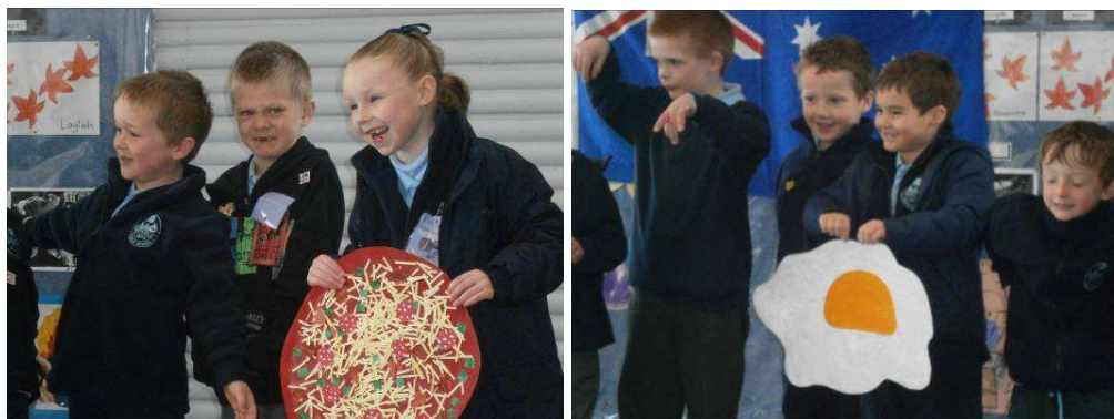
Kindergarten performs 'Wash your face with Orange Juice' at our last assembly!

Next Assembly - Friday 24 th August – This week 10.50am 5/6 to share their work - All Welcome!