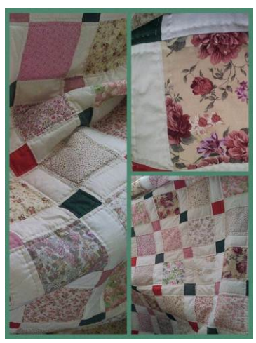
P&C Quilt Raffle – Drawn on Grandparents Day $2 each or 3 for $5 Please return your tickets this FRIDAY!!!