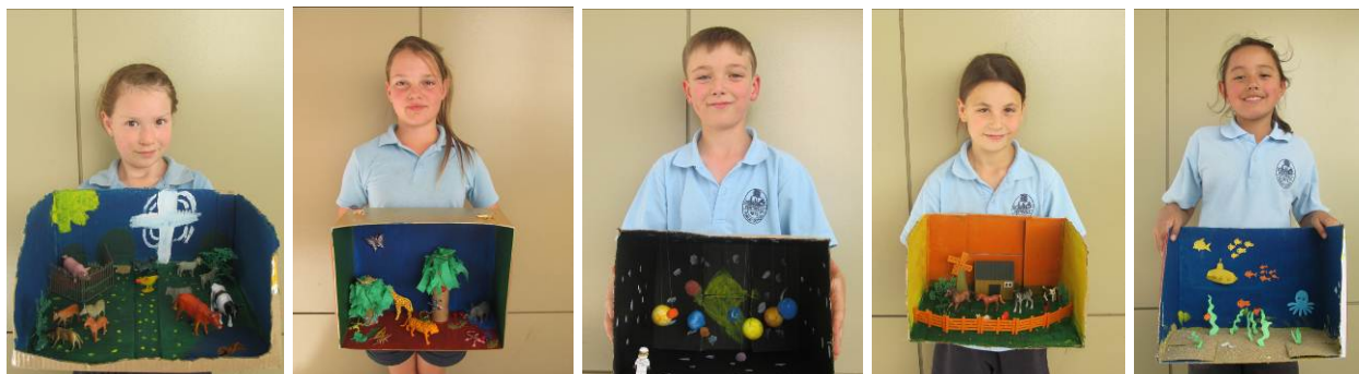
3/4 Class with their Dioramas