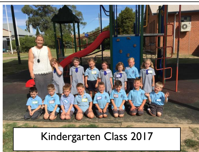
Kindergarten Class 2017