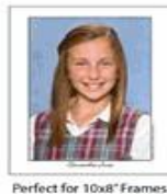
Perfect for 10x8" Frames