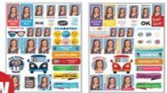
48 Personalised Stickers

Please note: Orders placed before 15/2/22 will not attract a late fee. Orders placed after this date will incur an additional $15. Traditional or Composite group and the presentation format are chosen by your school. Sibling photos, if available, can also be ordered online and must be ordered prior to your photo day. A late fee will apply for photos purchased after ordering has closed.