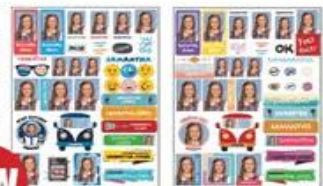
48 Personalised Stickers

Please note: Traditional, Composite or High-Resolution Virtual Group format is chosen by your school. Sibling photos, if available, can also be ordered online and must be ordered prior to your photo day. A late fee will apply for photos purchased after ordering has closed.