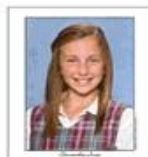
Perfect for 10x8" Frames